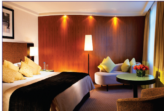
A bedroom in The Cavendish.

to earth cockney girl started out as a kitchen maid, and worked her way up to become manageress of this very stylish hotel. The Cavendish is still strong on hos-