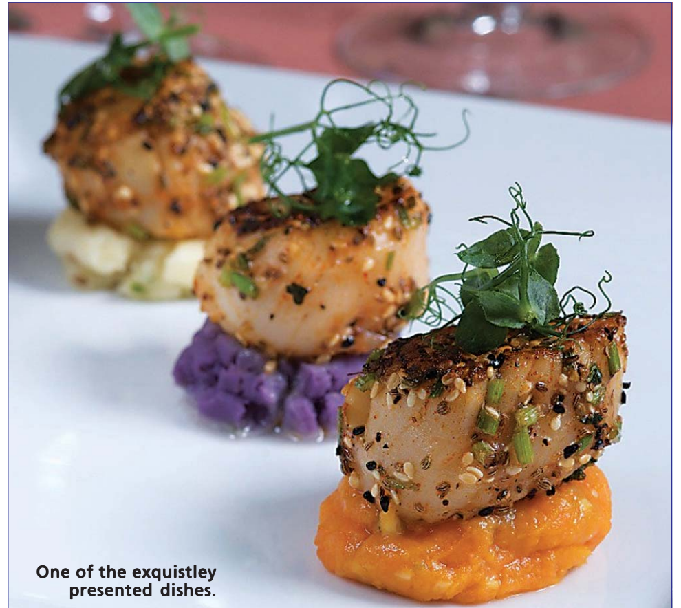
One of the exquisitely presented dishes.

It was very hard to fault any dish, or the imaginative presen-