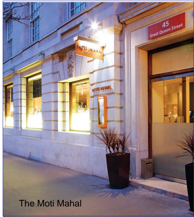
The Moti Mahal

If you like Indian food, this is a must, but expect to be surprised, this is probably unlike any Indian restaurant you have visited, its true 'Fine Dining' Indian style. First impressions are very good,